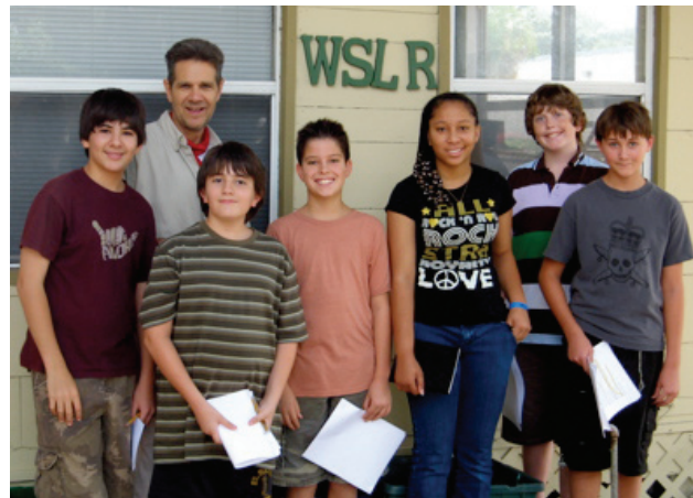
WSLR's Summer Camp for Middle School Students: Teaching Media Skills to our Youth