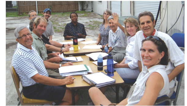
WSLR Board Meets at Kumquat

The large outdoor space and neighboring community venue at 525 Kumquat offer the station additional options to: